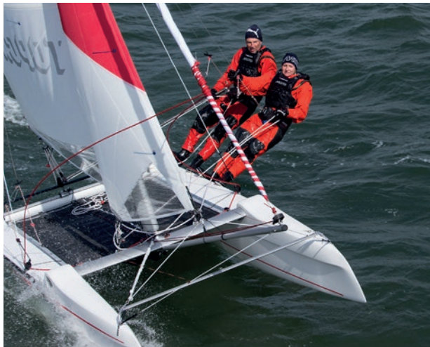
DOUBLE TRAPEZE AT 15 FEET