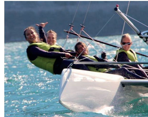
FAMILY & FRIENDS