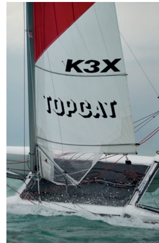
DECKSWEEPER MAIN SAIL

TOPCAT GMBH, WILDMOOS 1, D-82266 INNING AM AMMERSEE