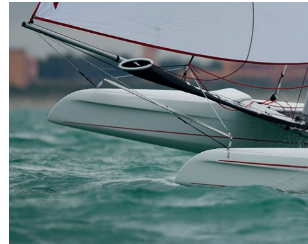
WAVEPIERCER HULLS WITH CHINES