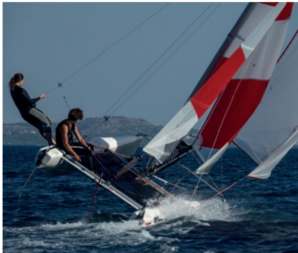
WORLD SAILING REGATTA CLASS

* 1 varies on the model | * 2 All prices in EUR incl. 19% VAT ex works. Offer subject to change. Valid to our terms of payment and delivery | * 3 Not to combined with Reacher/furling gennaker | * 4 Streamcut only | * 5 Ready to use from TOPCAT-Warehouse, incl. solid rubber stabilizer and 100km/h-certification with plate.