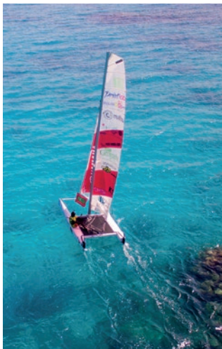
... AND CRUISING