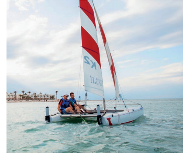
ENTRY IN REGATTA SPORT

* 1 varies on the model | * 2 All prices in EUR incl. 19% VAT ex works. Offer subject to change. Valid to our terms of payment and delivery | * 3 Not to combined with Reacher/ furling gennaker | * 4 Streamcut only | * 5 Ready to use from TOPCAT-Warehouse, incl. solid rubber stabilizer and 100km/h-certification with plate.