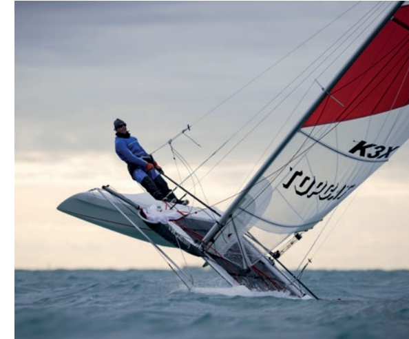
ONE HAND REGATTA CLASS

*1 varies on the model | *2 All prices in EUR incl. 19% VAT ex works. Offer subject to change. Valid to our terms of payment and delivery | *3 Not to combined with Reacher/furling gennaker | *4 Streamcut only | *5 Ready to use from TOPCAT-Warehouse, incl. solid rubber stabilizer and 100km/h-certification with plate.