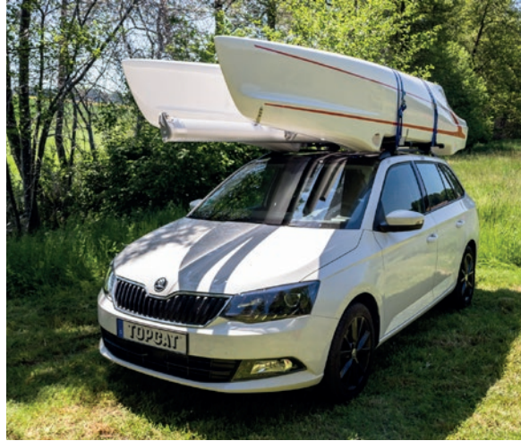
CAR ROOF TRANSPORT

*1 varies on the model | *2 All prices in EUR incl. 19% VAT ex works. Offer subject to change. Valid to our terms of payment and delivery | *3 Not to combined with Reacher/ furling gennaker | *3 Streamcut only | *4 Ready to use from TOPCAT-Warehouse, incl. solid rubber stabilizer and 100km/h-certification with plate.